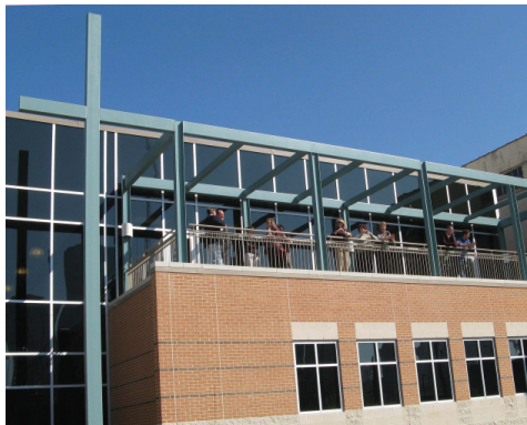
Members and guests enjoy the view from the second floor patio.

The new Education Center was open throughout the morning for those who had attended worship to tour the facilities. Faculty and staff of Trinity were on hand to guide people through the building. Over and over again, comments were made about how wonderful the building is and what a blessing it will be to the ministry of this congregation.