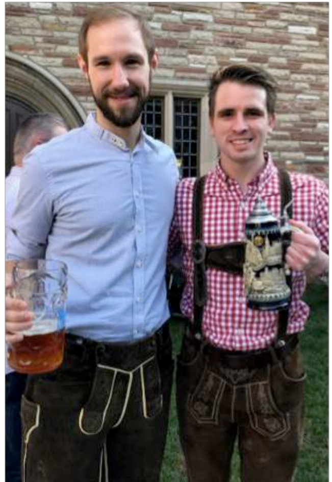
Showing off my lederhosen at Oktoberfest.

"The grace of the Lord Jesus Christ be with your spirit." (Philippians 4:23 ESV)