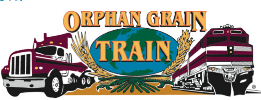
Relief for Human Need Worldwide

We couldn't have asked for a better mix of guests aged 20 into their 80's - there was no generation gap as they bid over each other at the silent auction tables. Interactive riddle solving and hunting for crazy clues kept the room in motion as guests